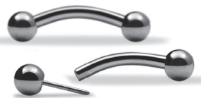
THREADLESS CURVED BARBELL