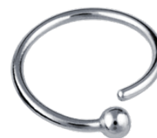
FIXED BEAD RING